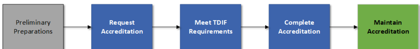
Figure 1: TDIF Accreditation Process Overview

There are two phases of the TDIF Accreditation Process: